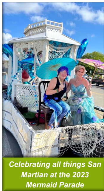
Celebrating all things San Martian at the 2023 Mermaid Parade